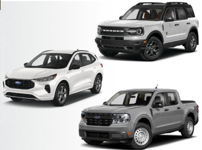
2023-2020 Ford Escape, 2023-2021 Ford Bronco Sport & 2023-2022 Ford Maverick